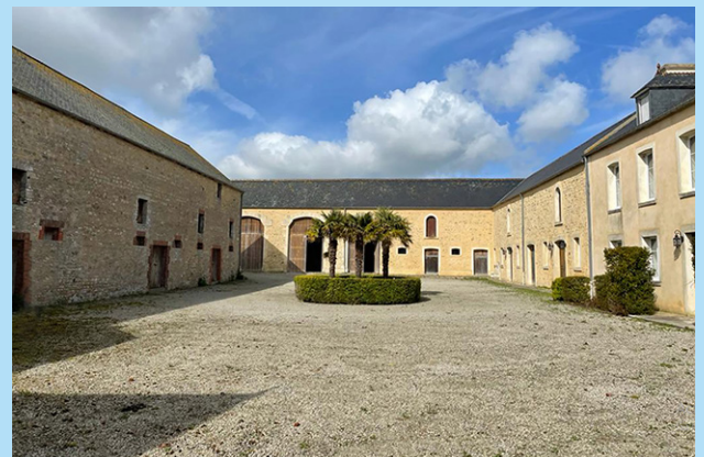
The B&B Le Clos de Bas Courtil

To complete your experience of the French life in this region the well-known producer Romilly offers especially for us a Cider-tasting. At their 1.000 year